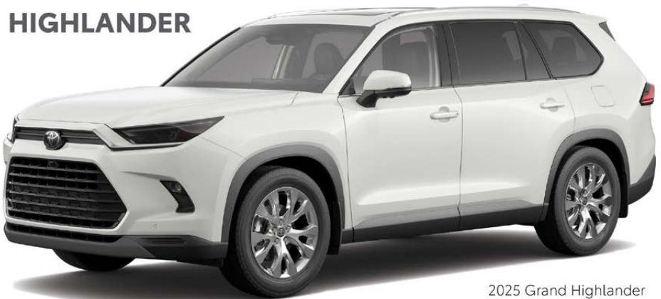
2025 Grand Highlander Hybrid Limited AWD